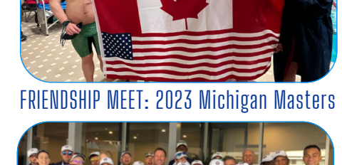
FRIENDSHIP MEET: 2023 Michigan Masters