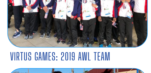
VIRTUS GAMES: 2019 AWL TEAM